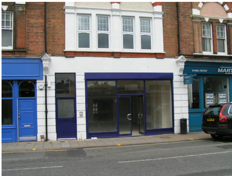
11 The Broadway, Woking, Surrey, GU21 5AP

(With consent for A1, A2 and A3 Use and potential for D1 subject to planning)