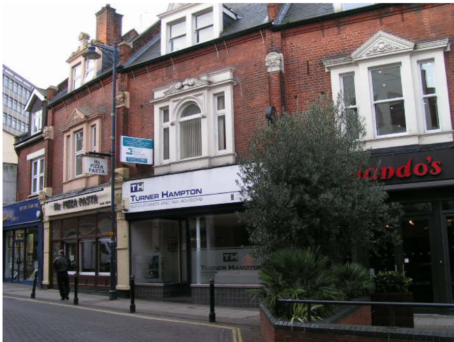
22 Chertsey Road, Woking, Surrey GU21 5AB