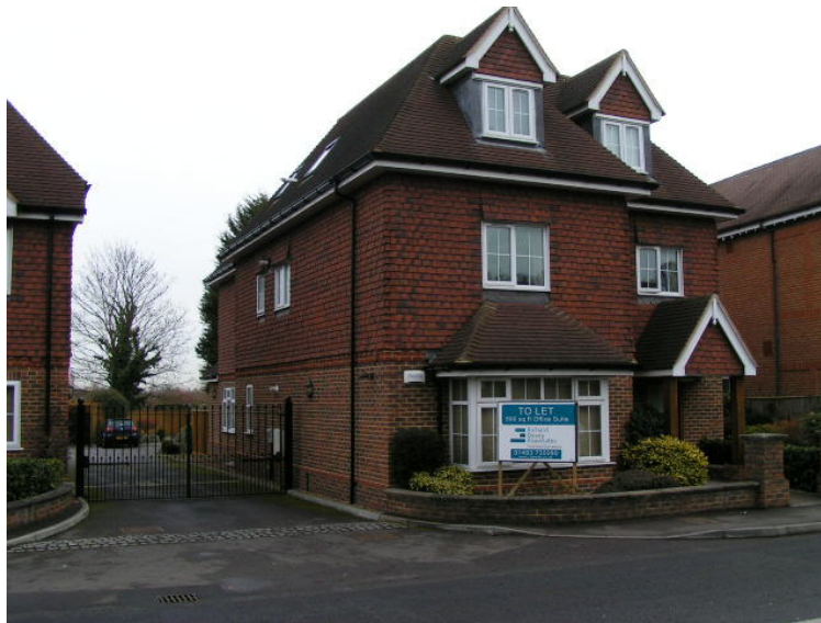
Grove House, 110, Send Road, Send, Surrey GU23 7HN